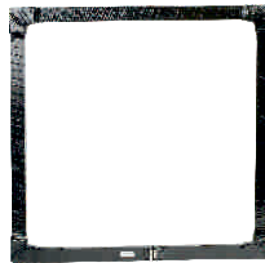
Rectangular CBCT available in Customised Sizes