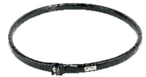
Round CBCT available in Customised Sizes