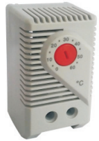
a) VIPS TH NC