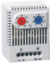
c) VIPS DTH