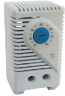
b) VIPS TH NO