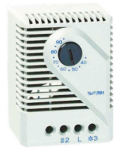
d) VIPS HG